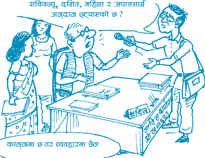
सचिवज्यू, दलित, महिला र अपांडलाई अनुदान छुट्याएको छ ?

o; /L u7g ul/Psf]pkEffQm ; ldt n]sfofj lwn]Joj :yf u/đf] pkfQm ; ldt sf]lfdtf lj sf; Pj + kžf; lgs vr{ug{sh nfutsf]tlg klztz; Dd /sd dfq vr{ugk]g] Joj :yfsf]; đ] pNn3g ePsf]5 . ; f3bf/-3f]fv]l ; đf-sf]feGhof a ; 8ssf]pkfQm ; ldt sf kbfwsf/ln]6lnkđ lanafktsf] eQngl eg] dfq * & xhf/ / vfhf vr{&} xhf/ e6bf a9l eQngl lnPsf 5g\ ; fy}lhNnf eđof tyf eQafakt klg b; f]xhf/ ?kđf"vr{ u/đf]:yfglo Ps JolQmatfp5g\ æsfgg t ; j {fwf/0nf0{dfq xđf pgl l6kk0fl u5đw/fhgllts bnsf